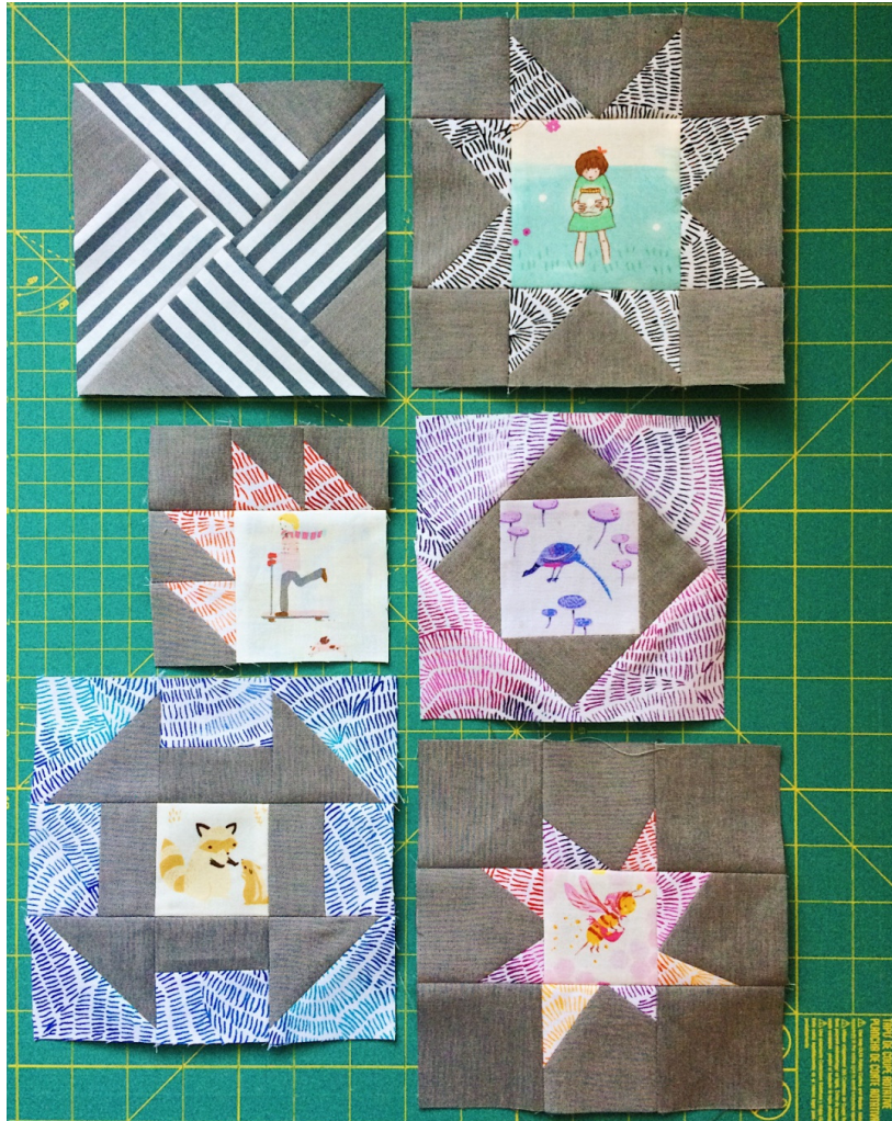
Economy Block Sawtooth Star Wonky Star