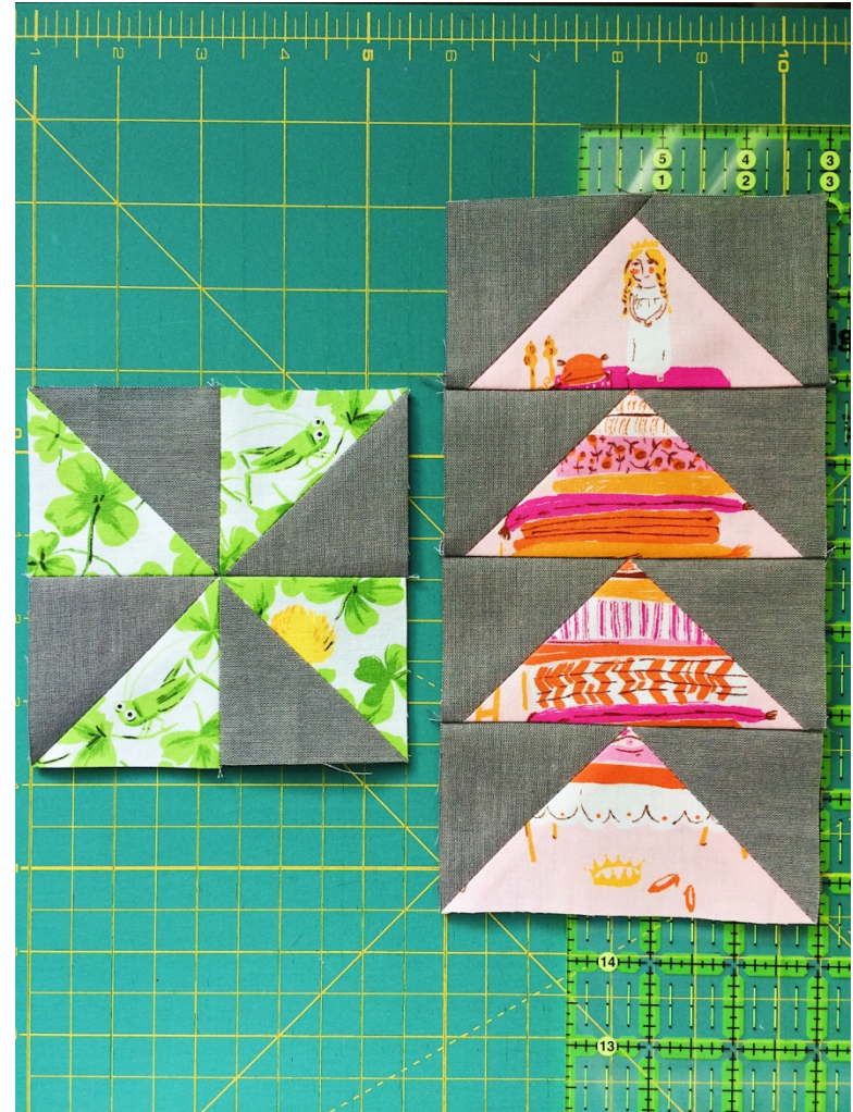
Churn Dash Half Square Triangle Snowball Block